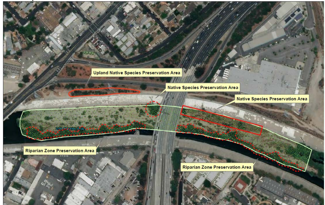
Figure 1. Project Area

Approximately 40,000 cubic yards (cy) of accumulated material from the proposed project area would be removed to the design elevation of the channel invert across the entire width of the channel. The design elevation for the channel invert is the top of the toe. The depth of sediment to be removed ranges from 2 to 8 feet. Clean excavated material would be transported and disposed at a Corps-owned sediment placement site downstream of Lopez Dam. Lopez Dam is located near the city of San Fernando, on the Pacoima Wash, in the north-central part of San Fernando Valley, Los Angeles County, California. There would be no structural alterations or modifications of structural element of the engineered channel.